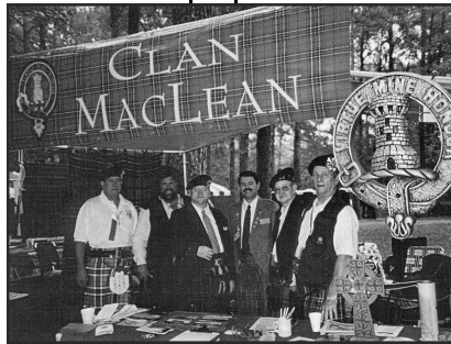
Clan Gillean at Stone Mountain

This year, we are making efforts to review and update our membership database by finding and correcting incorrect addresses (caused by change of residence, etc.). We are also asking our members to supply us with their email address with the hopes of communicating more effectively electronically in the future.