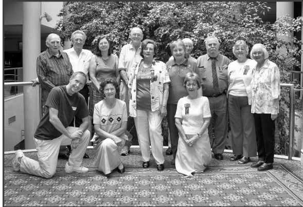
Members & guests after their Annual General Meeting in November: