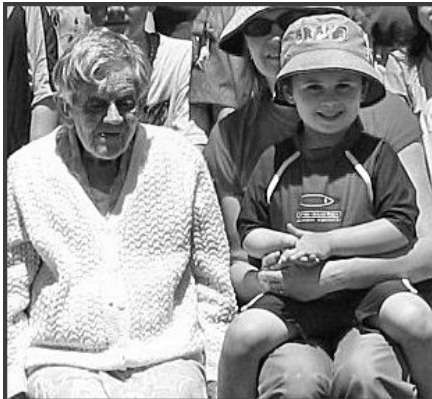
Our oldest & youngest members at the family picnic

Greetings to our Clan Maclean Cousins worldwide, from New Zealand in the South Pacific. It is only when we really study our history and genealogy that we realise just what an impact the Scots made in the settlement and development of this small country. We are pleased to say that Macleans and their descendants are still making a significant contribution to our country and our society.