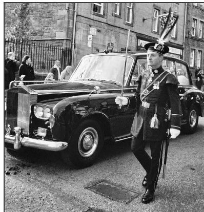
The Chief leads the Royal Company of Archers (Her Majesty's bodyguard in Scotland) at the opening of the new Scottish Parliament in Edinburgh. Oct. '04.