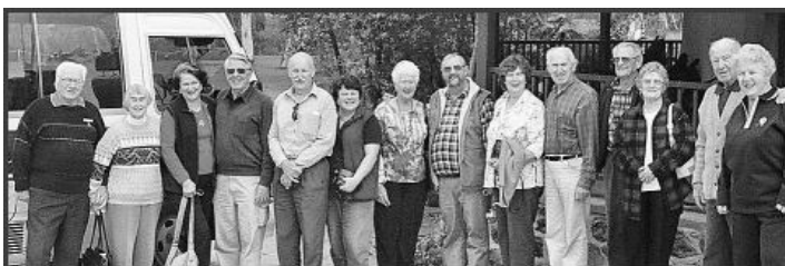
Clan members enjoying a moment between wineries

Our Annual Chief's Banquet was held in Tanunda, in the renowned wine growing area of the Barossa Valley in South Australia. Sixty five members and friends attended the evening with many travelling from as far afield as Eastern Victoria, Melbourne and Canberra and involving round trips of over 1,800 kilometres (approximately 1,130 miles). For those who were able to arrive on Friday a very noisy and enjoyable tour of local wineries was organised. The tour provided a great opportunity for members to get to know each other while enjoying a sample of the various wines produced in the Barossa Valley.