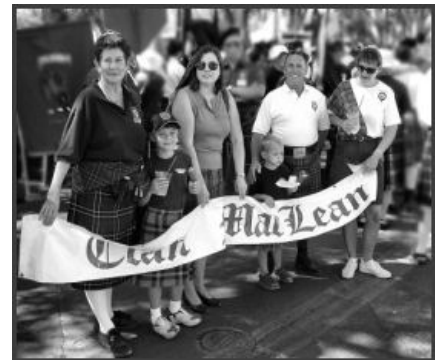
Members of Clan Maclean California/ Nevada proudly carry the banner at the Pleasanton Games