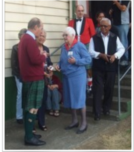
Above left: At the Kauri industry museum in Matakoho