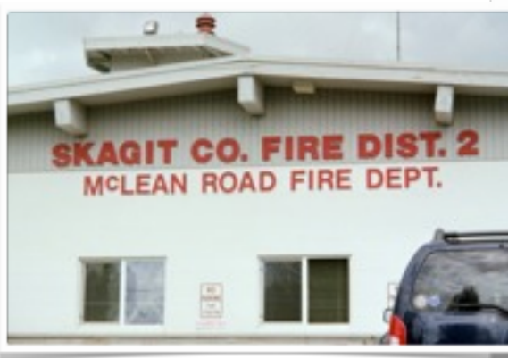
Below: Left to right. McLean building, Mt Vernon, WA McLean fire station, WA Duart Castle tattoo seen at Eugene Games