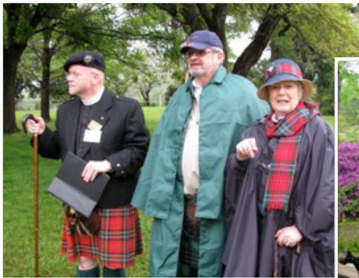
Lower right: The Chief & Lady are piped to the reception