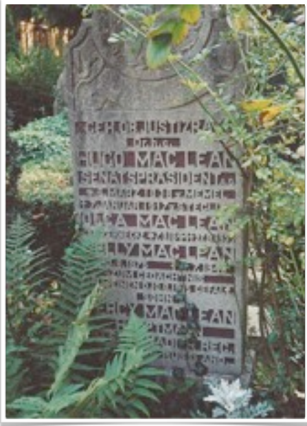
The Maclean family gravestone in Berlin