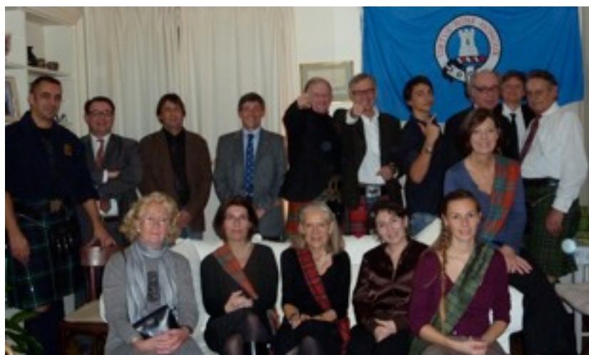
Members at the cocktail party