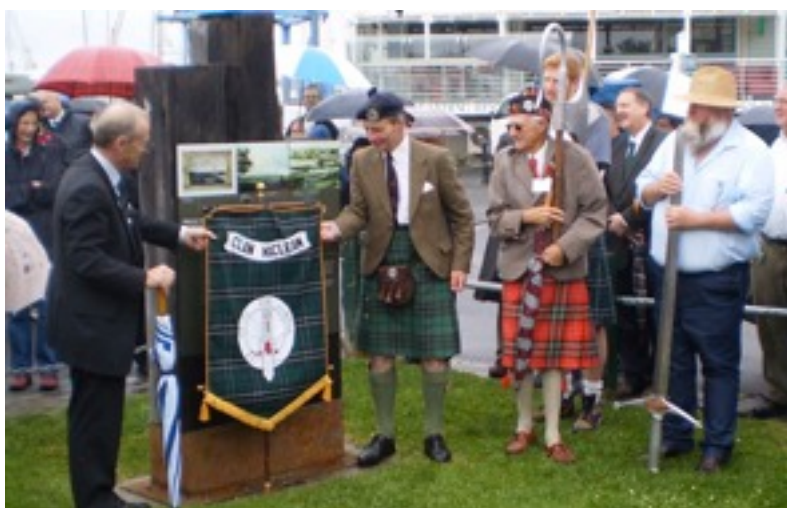
The Chief unveiling the plaque commemorating the first McLean settlers at Williamstown

Public activities followed. Unfortunately we could not control the weather, and the Chief was probably reminded of Mull. Some hardy members took a rain-soaked trip with the Chief on Port Phillip Bay in the tall ship 'Enterprize', and re-enacted the landing of the first McLeans at Williamstown in 1835. We then proceeded to our family day which was well