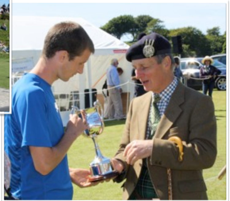
Above: Spectators at the Mull games

The venue of our annual Gathering, which involves a Reception, Dinner, Entertainment and Dance, has moved