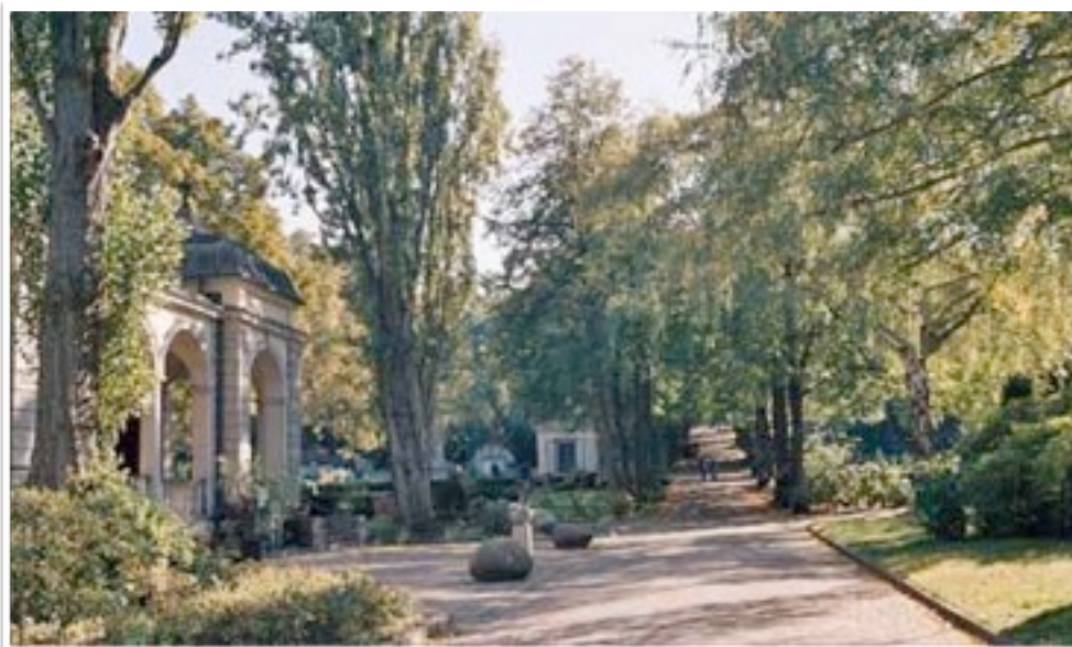
Alter St. Matthäus Cemetery

clan hailing from a handful of islands in the inner Hebrides. Yet in Berlin I read that a Hugo Maclean (born 1838, died 1917) had been a Senatspräsident (or presiding judge in the High Court). Also I read that his son Percy had died on the Eastern Front during the First World War. Buried alongside Hugo was a second Percy Maclean (born 1907, died 1989). Around me a breath of wind stirred the fallen leaves, touching my neck, making my hair stand on end.