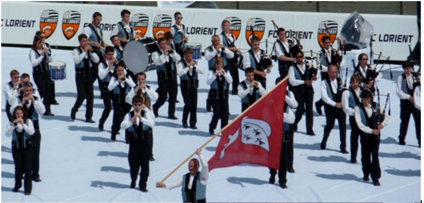
Above: A Breton Bagad Centre left: Gaïta from galicia, Spain Centre right: Breton spectators Lower right: Spanish Gaïta