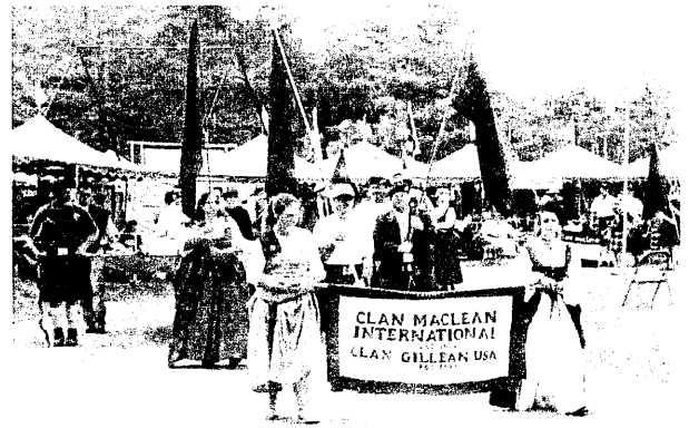
Clan Gillean USA makes their way around the track during the Parade of Tartans.

July 10-17, 2003 marked the dates of the Forty-eighth Annual Grandfather Mountain Highland Games, also known as "the great East Coast Clan Maclean FAMILY reunion". We were represented in large numbers, and it showed by our participation!