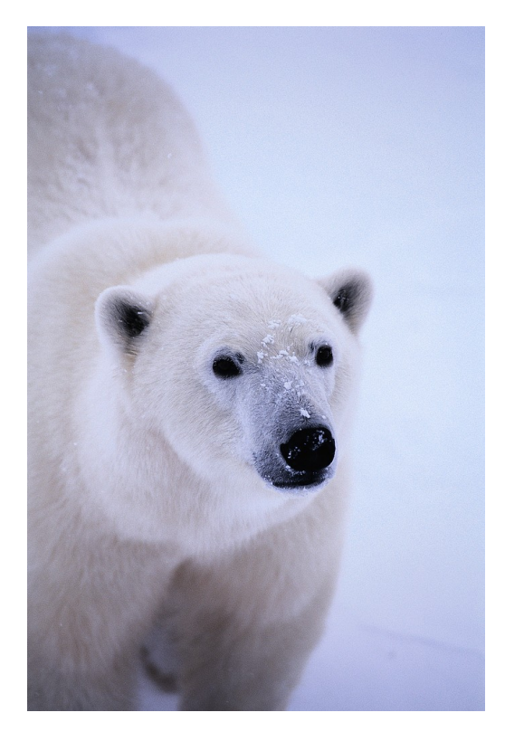
The more I read the article, the more excited I became. Just thinking of how far the polar bear had traveled astounded me. Thoughts were