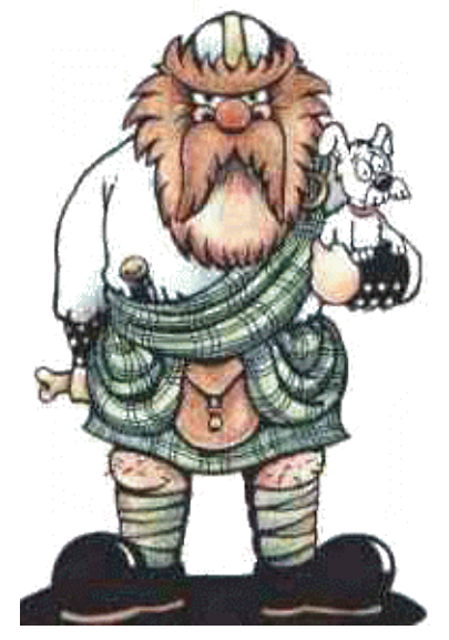
(Continued from page 3)

Word got back to the Macleans that the organizers of Tartan Fest had all agreed that their decision to add a clan of the day was one of the best decisions made in the history of the celebration. This day had proven to be their best Tartan Day celebration ever, with the largest attendance ever recorded. The only problem was that they had to figure out how to make the Macleans the clan of the day EVERY year!