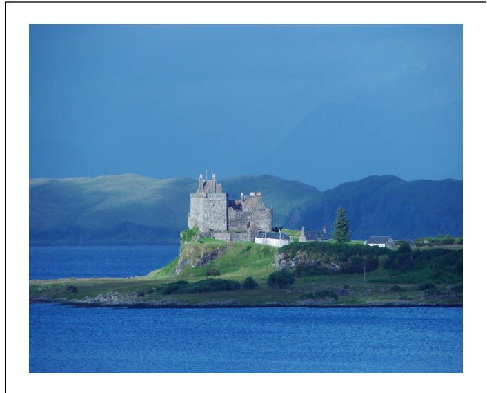
Duart Castle on the Isle of Mull jutting proudly out into the Sound.

Carrying on a heritage and tradition all Macleans can be proud of, our 28 th Chief, Sir