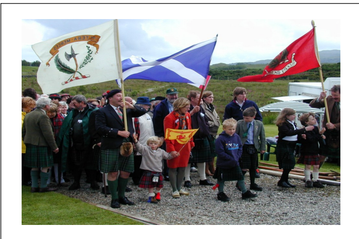
Preparing to march to Duart Castle.