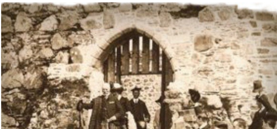
Historical Photo of Gathering at Duart Castle in 1912 with Sir Fitzroy Maclean welcoming members of Clan Maclean.