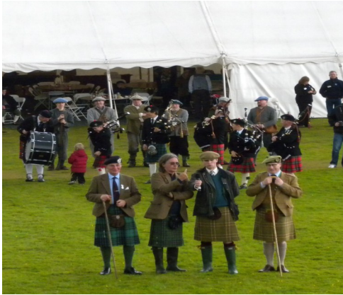
At the Closing Ceremonies, of the 2012 Gathering.

Songwriter and musician Dougie Maclean performed his award-winning hit, "Caledonia", lovingly referred to as "Scotland's alternative anthem," during the Grand Clan Ceilidh at the 2012 Gathering at Duart Castle. For those who made this historical journey from different parts of the world, Caledonia had such impact with almost a siren's quality that beckons you to the ancestral Highland Home on the Isle of Mull.