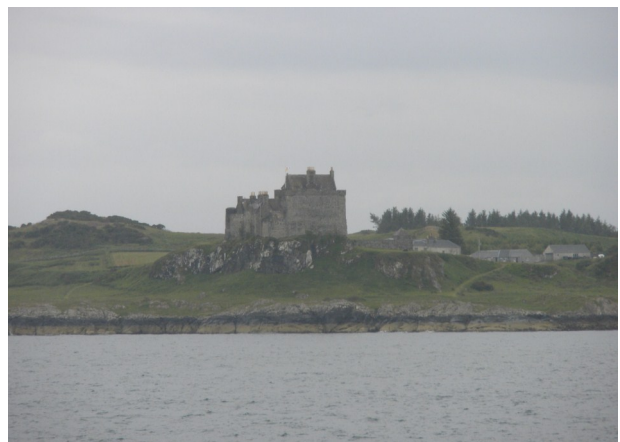
Duart Castle is a fortress and a vision of strength as the ferry makes its approach to the Isle of Mull.