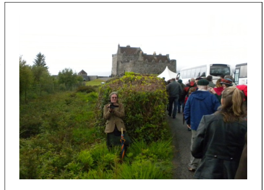
Dougie Maclean has fun video taping the march to the Castle Gates.

As many search to claim a drop of Scottish blood by birth, through marriage or best of friendships, kindred spirits can share the hauntingly beautiful tunes and lyrics by Dougie Maclean during his USA Concert May 13-18 (Schedule and states page 6).