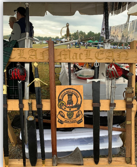
Clan MacLean Weapons Display at Richmond Games