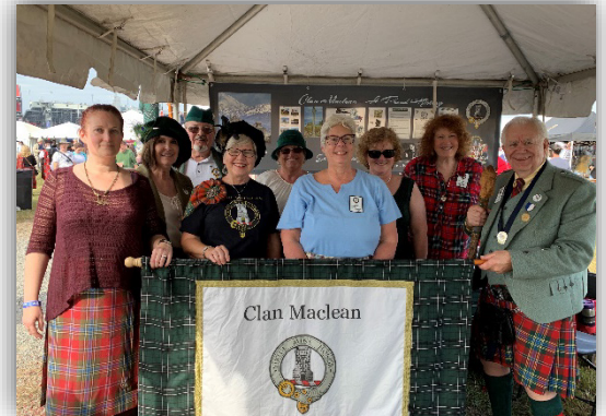
Clan MacLean, Annual General Meeting, Richmond Games, October 2019