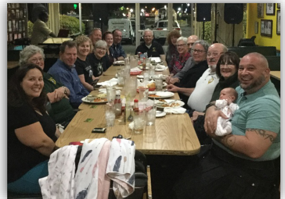
Clan MacLean Dinner, Richmond, VA, October 2019