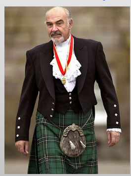
Aug 25, 1930 - Oct 31, 2020