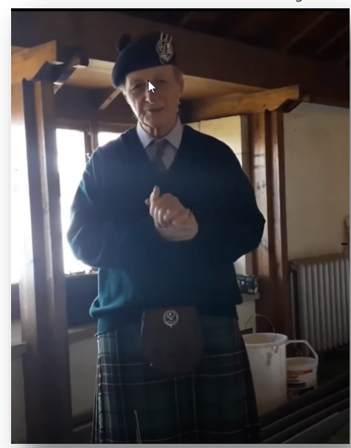
Chief Sir Lachlan Maclean delivers welcome message from Duart Castle, Isle of Mull, Scotland.