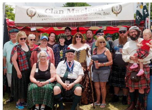
Clan MacLean at Grandfather Mountain Highland Games, July 2021