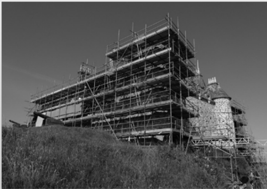
Next spring the scaffold will be removed to reveal the large West Elevation which faces the carpark and the entrance road to the castle.