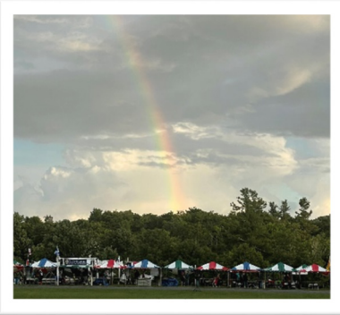
Rainbow over MacRea Meadows, GFMHG, 2021

For the first time since the pandemic began, the clans gathered together at Grandfather Mountain and were greeted by a stunning rainbow over MacRea Meadows. Our hostess