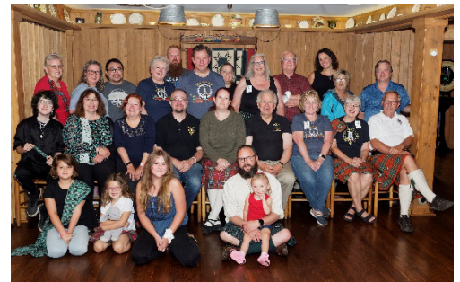
Family and Friends - CMAUS Annual General Meeting, July 2021

Tickets for GMHG 2022 are already on sale and we hope we will be able to gather again safely!