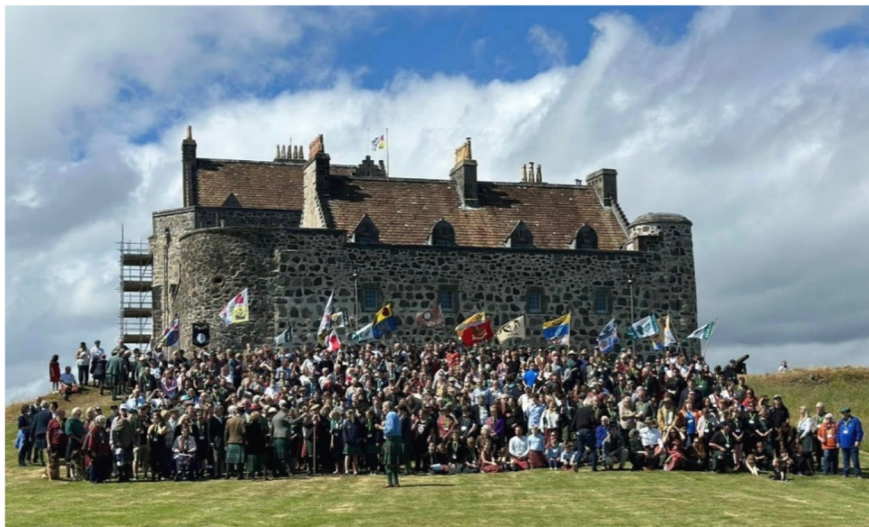
International Clan Maclean Gathering, June 24, 2023, Castle Duart, Isle of Mull, Scotland.

(ME, MA, NJ, NH, NY, PA, RI, VT) Rep: Vacant