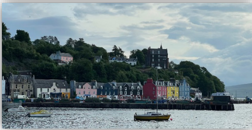
Top: MacLeans march to Castle Duart; Middle: Chief's welcome; Bottom: Tobermory Harbor