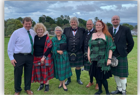
CMAUS Executive Committee members and their families attend The Grand Dance