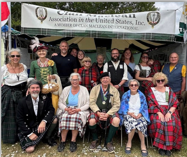
CMAUS Clan Gathering, July 8, 2023, Grandfather Mountain Highland Games