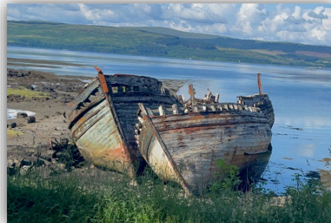
The Three Ladies, Salen Beach, Isle of Mull Landmark, located on the road to Tobermory.

The week kicked off with a welcome reception on Monday night followed by a celebration and dinner at Macgochan's Pub.