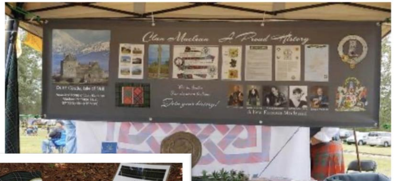
Sample Table display with informational MacLean Banner. Banners can be hung with cord or zip ties to keep them secure.