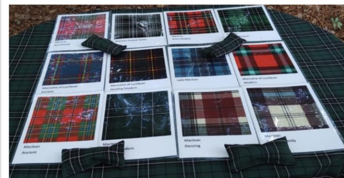
Right: Kits include cards showing the different MacLean Tartans.