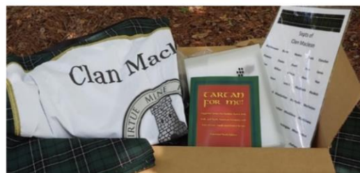
Above: Convenor Kits come ready to use!