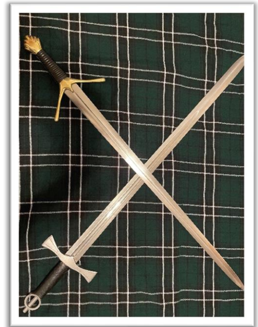
The Bastard Sword, part of the Clan MacLean Weapons Collection maintained by Weapons Master Van Shoemaker.

The ability to wield a bastard sword effectively was considered a sign of outstanding swordsmanship and physical agility. The medieval knight's bastard sword is a classic example of the medieval swords found during the later part of the 14th century. This battle-ready sword, along with their historical counterparts were commonly used by nobility during the 100 years' war,