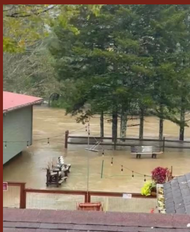
Flooding at the Pineola Lodge and Campground following Hurricane Helene, September 2024.